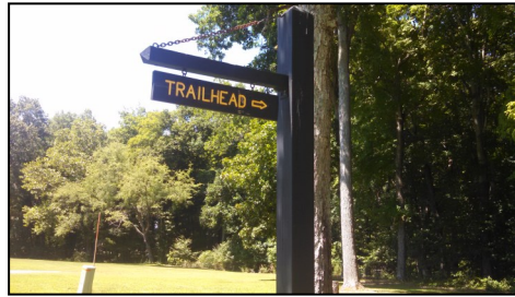
The Trailhead at Paynetown.

What should you bring? Many walkers will find hiking poles to be helpful. Plan on bringing and carrying your own water.