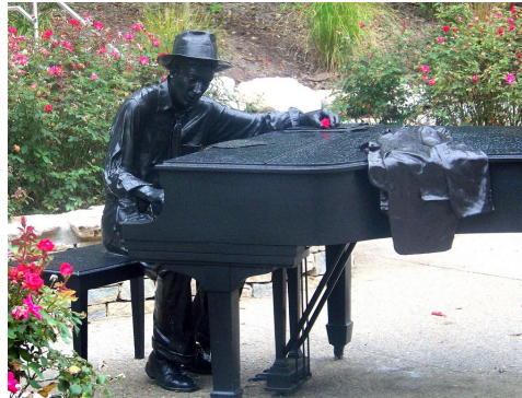
On the East Loop, you'll pass by the bronze Hoagy Carmichael statue on the IU campus.

Trail Description – The walk consists of two different 5K loops, each passing by points of interest honoring legendary musician Hoagy Carmichael. Do both loops for a full 10K.